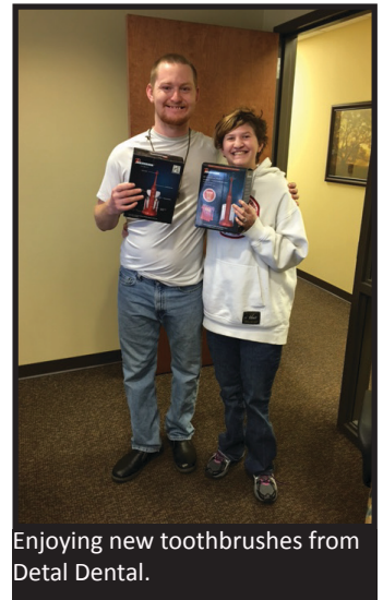
Enjoying new toothbrushes from Detal Dental.