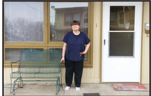
SLI person served outside of her home

In our Independent Living homes, we serve 38 men and women who have learned daily living skills and most have a part-time or full-time job. SLI provides services 15 hours a week to help with their needs.