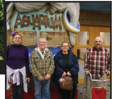
CIP members visiting the library.