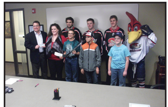
TCM persons served receiving tickets to a Topeka RoadRunners hockey game.

SLI has access to professionals trained and educated for autism spectrum disorders, mental health and behavioral supports and planning. Our SLI Staff is trained in social work, psychology, human services, nursing and mental health. The Targeted Case Management program works with each person served to make them aware of service that assist with their needs.