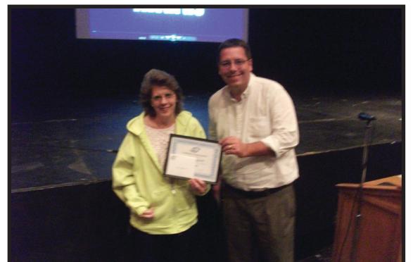
TCM persons served and staff being recognized at the SLI Annual Awards.