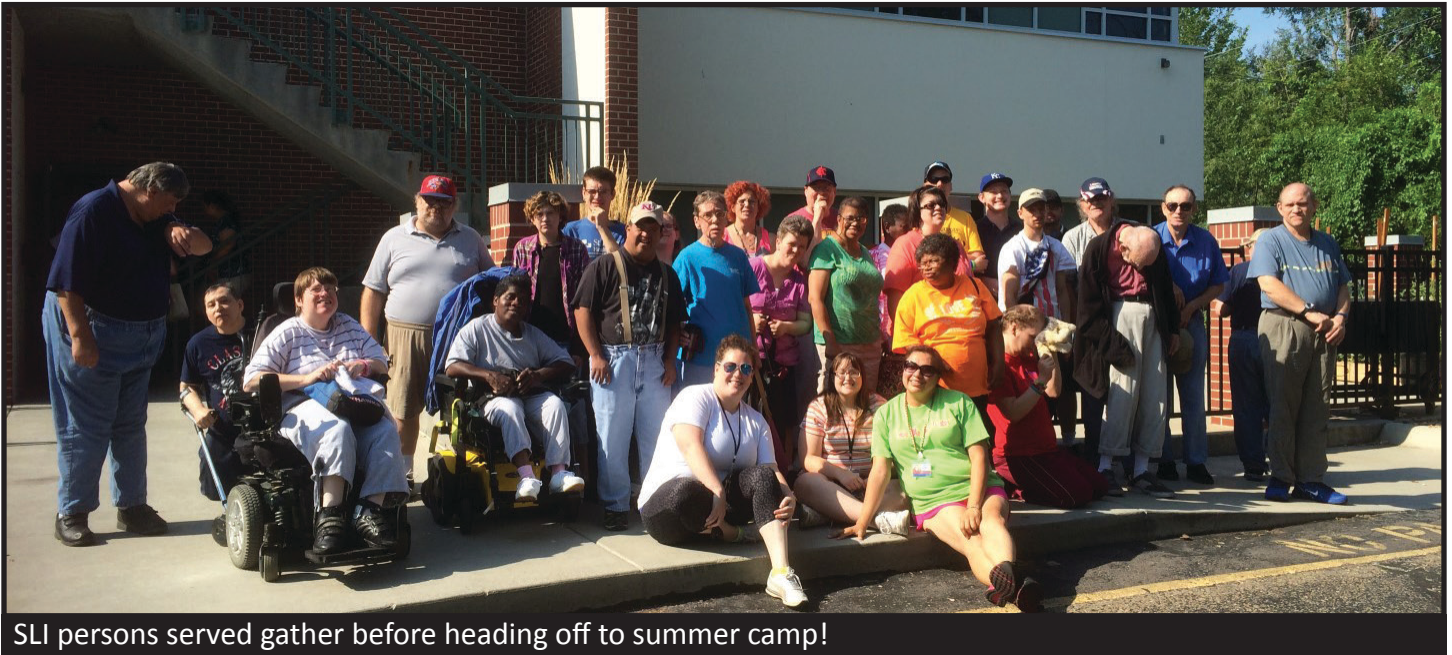
SLI persons served gather before heading off to summer camp!

Serving people with intellectual disabilities since 1971