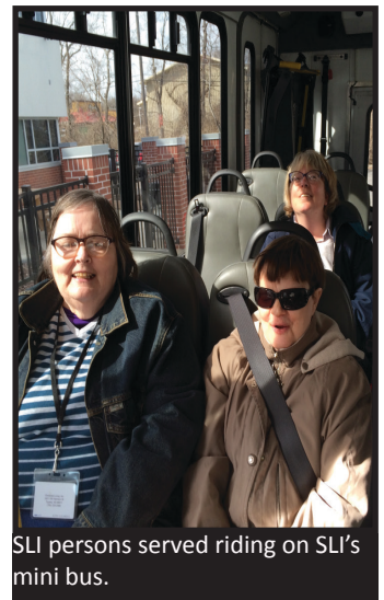
SLI persons served riding on SLI's mini bus.