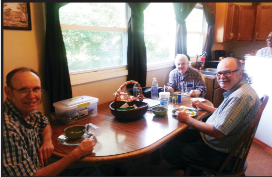
Evening dinner in one of the SLI homes.

The Community Living Program keeps individuals engaged in activities, volunteering in the community, learning daily living skills and teaching responsibility. We serve over 100 men and women living in 19 SLI homes and provide services for our person served 24/7/365 days a year.